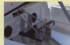
BIKE PRO wheel chock