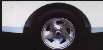
Standard Aluminum rims