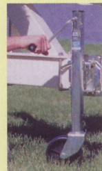
Swivel wheel jack