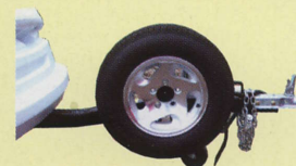
Aluminum spare tire