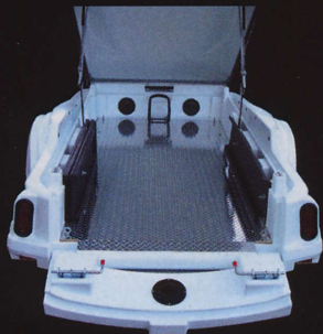
Standard Aluminum checker plated floor