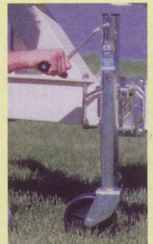
Swivel wheel jack