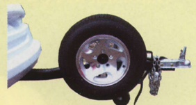
Aluminum spare tire