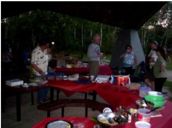
What a feast!