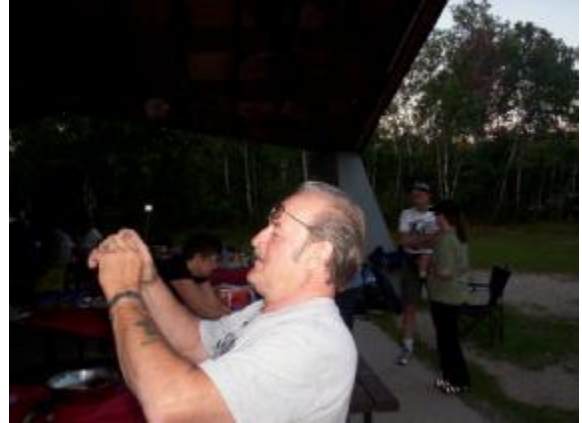
No-one knew what he was doing, but it looks important.