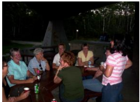
A meeting of the minds.