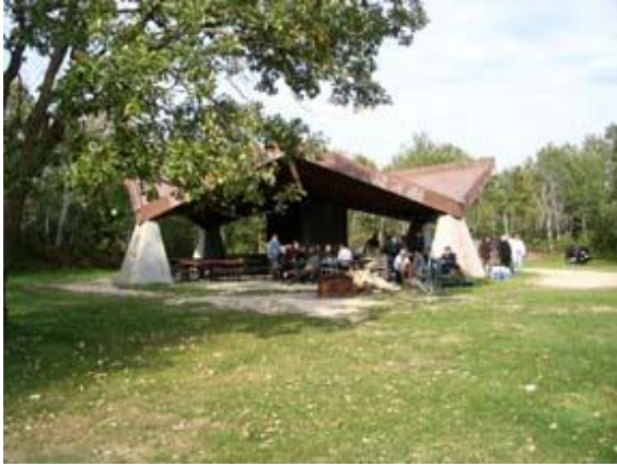
Windup Picnic Site