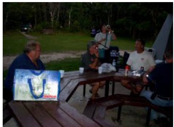
Now that's a lunch bag!