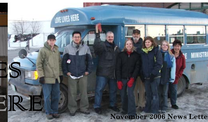
November 2006 News Letter