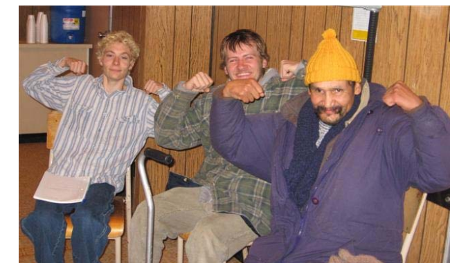
Hanging out at the trailer