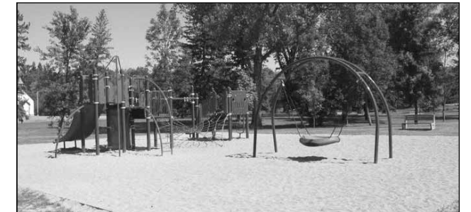
A grant to the Beautiful Plains Recreation Commission went towards this playground structure at Riverbend Park.