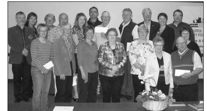
Grant recipients at the 2011 grants evening.