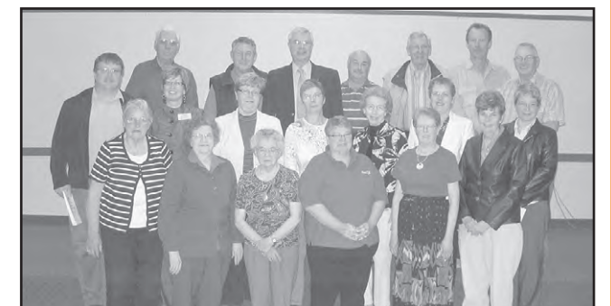
Grants presented in June 2009 totaled $36,605. Grant recipients are shown in this group picture.